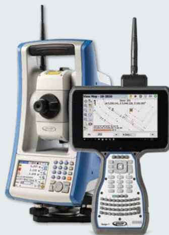
FOCUS 35 + Ranger 7

Offered in Survey Pro this technique allows a robotic total station to perform an aided search for an optical target using an initial GPS position. The remote instrument can then be directed towards the robotic roving operator using the GPS position and a subsequent search is quickly performed to re-acquire the target at the robotic rover. This technique greatly reduces wasted time, improving your field work efficiency.