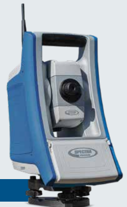
FOCUS 35 RX

The new FOCUS 35 RX models offer 12 hour extended operation through a unique dual battery system, eliminating any need to stop and change battery during a full day's work.